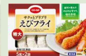
CO-OP crisp & tender fried shrimp