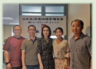
Employees in Qingdao