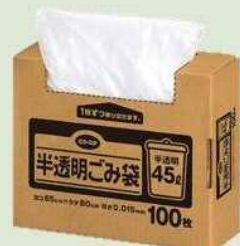
CO-OP semi-transparent garbage bag