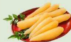
CO-OP herring roe