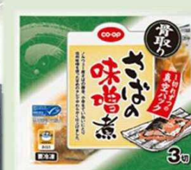
CO-OP miso simmered mackerel