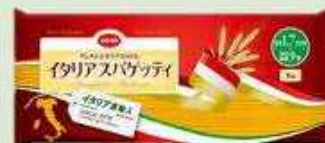
CO-OP Italian spaghetti