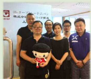
Employees in Shanghai

To improve member satisfaction, we aspire to: develop and provide products that can only be produced outside Japan, reduce complaints, proactively contribute to JCCU's import business plan and improve the level of services we provide, conduct activities for food safety and quality assurance from ethical and food defense perspectives in line with current trends, and produce RSPO- or MSC-certified or environmentally friendly products. With this in mind, we are committed to attentively carrying out our business activities.