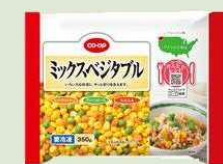
CO-OP vegetable mix