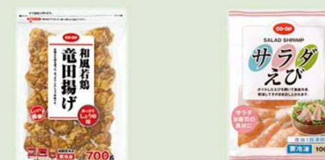
CO-OP deep fried chicken CO-OP shrimp for salad