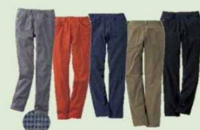
stretch pants for JCCU mail order business