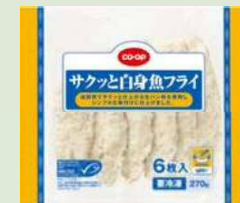
CO-OP crispy fish fry