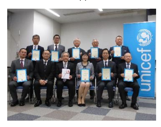
Participants that took part in the 6th ceremonial donation ceremony