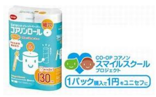
CO-OP Brand toilet paper (core non roll)