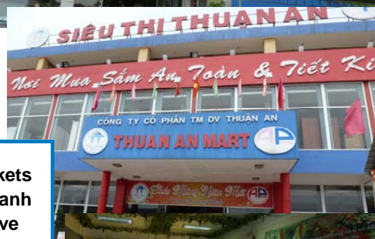
3 Supermarkets of Thuan Thanh Co-operative in Hue