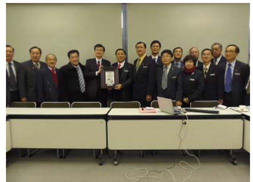
Delegates pose for a group picture

Delegates were impressed about the various credit facilities in Japan.