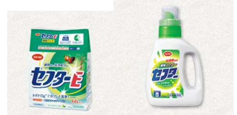
Co-op detergent "Sefter-E"