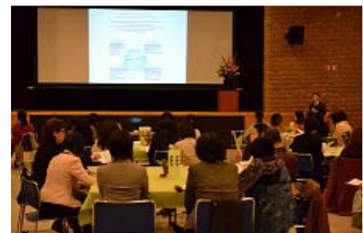
Scene at the forum