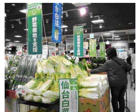
Sendai Cabbage displayed in Miyagi Co-op Store