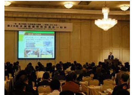
The scene of the meeting

The seminar was held in Sendai to help raise participant's awareness of Co-op sanchoku and to encourage themselves by feeling the energy of producers, Co-ops and members.