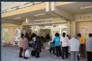
Scene at the "local station"

A total of 150 people participated in the activities symbolizing Co-ops commitment in energizing the community.