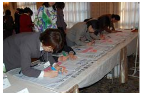
Scene at the sectional meeting