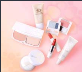
Example of Co-op cosmetics "makeup series"

In this renewal, JCCU conducted interviews and surveys to monitor a total of 943 members and used the result as the baseline for renewal.