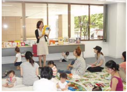
Scene at child-raising circle

Other than these shopping supports, Co-op stores provide rooms for Kosodate Hiroba (childraising circle) and other events to support members' child-raising life.