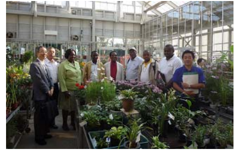
Study tour to JA Tokyo Musashi

This is the second time the study tour has been organised for the African Co-operative Leaders following the tour which was held in August 2010.