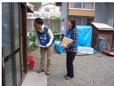
Scene of a home visit