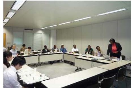
Final review of the study visit