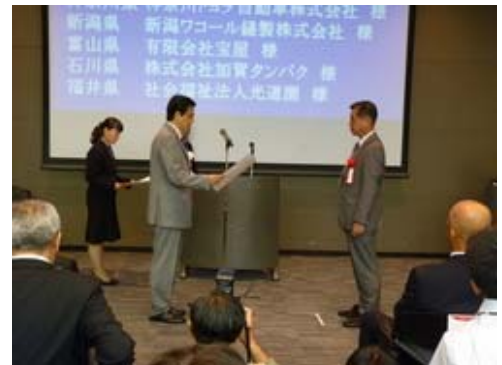
Scene of the awarding ceremony

Co-op Plaza 3-29-8, Shibuya, Shibuya-ku Tokyo, Japan 150-8913 +81(3)5778-8103 tel +81(3)5778-8104 fax http://jccu.coop/eng/ email:kokusai@jccu.coop