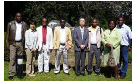
Participants pose in a group photograph