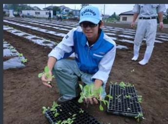
Seedling cultivated by the students of Miyagi Agricultural High School.