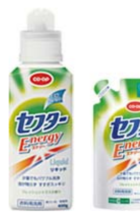
Co-op Sefter Energy Liquid 400g bottle 300g for refill

With more than 250 members participating in monitoring the development of this new detergent, no doubt, this new product reflects members' opinions such as fragrance and doneness of rinse.